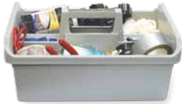
*Product and tools not included

Tote Tray Organizers, Glue Tote, Storage Organizers and Tape