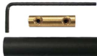
Ace Connector (Small)

25% longer heat shrink tube that helps the entire connection resist water intrusion.