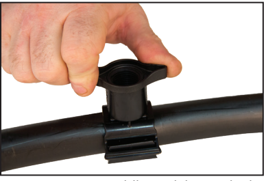
Screw TAP into saddle until the tap locks. Handle will be parallel to pipe.

NOTE: To reposition SnapTap Elbow, turn clockwise only.