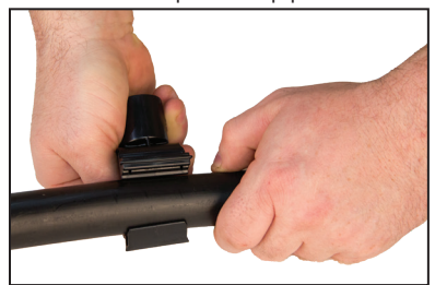
SLIP saddle onto pipe BEFORE LATCHING.

Note: Do not install tap into saddle until saddle is in place on pipe.