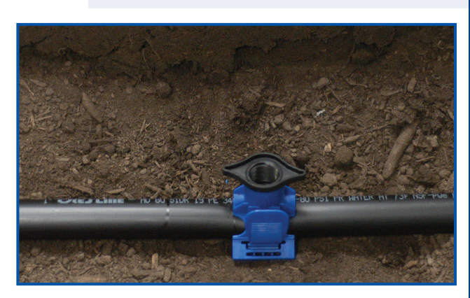
U.S. Pat. 6,510,865. All other trademarks, U.S. and Foreign Patents apply. All Rights Reserved.

www.kinginnovation.com (P) 800.624.4320 (F) 636.519.5410